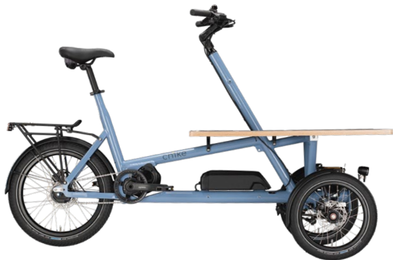
● Item No. 0.230.031/7