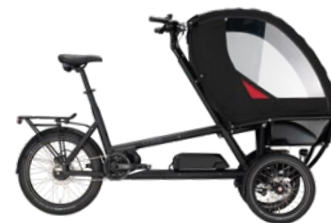
● Item No. 0.230.020/0