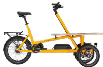
● Item No. 0.230.032/5