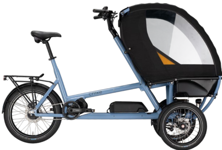
● Item No. 0.230.021/8