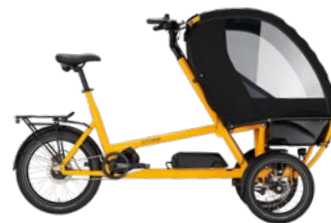
● Item No. 0.230.022/6