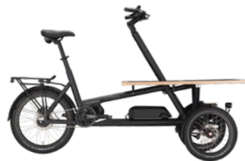
● Item No. 0.230.030/9