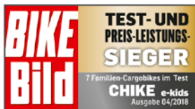
CHIKE e-kids TEST WINNER AND PRICE/PERFORMANCE WIN- NER

BIKE BILD had seven families test seven different e-cargo bikes for a period of seven months. Afterwards, the families were able to award stars – for the winner, there were seven stars, six for second place and so on. Then the stars were added up.