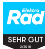
CHIKE e-kids VERY GOOD Test: Six "special bikes"

"We are very impressed by the overall concept of the Chike. It provides good protection for children as a very compact bike. Its tilting technology makes the bike easy to ride and a clever feature allows the wheels to be locked to make loading the bike easy work."