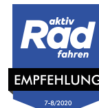
CHIKE e-cargo RECOMMENDATION Test: Endurance test

"Even with a load of 60 kilos, the bike remained incredibly stable. Tipping over? False alarm! Its parking function ensures it is stable when standing. The e-kids is a super nimble cargo bike with small dimensions. It puts the fun into transporting children! Farewell second car!"